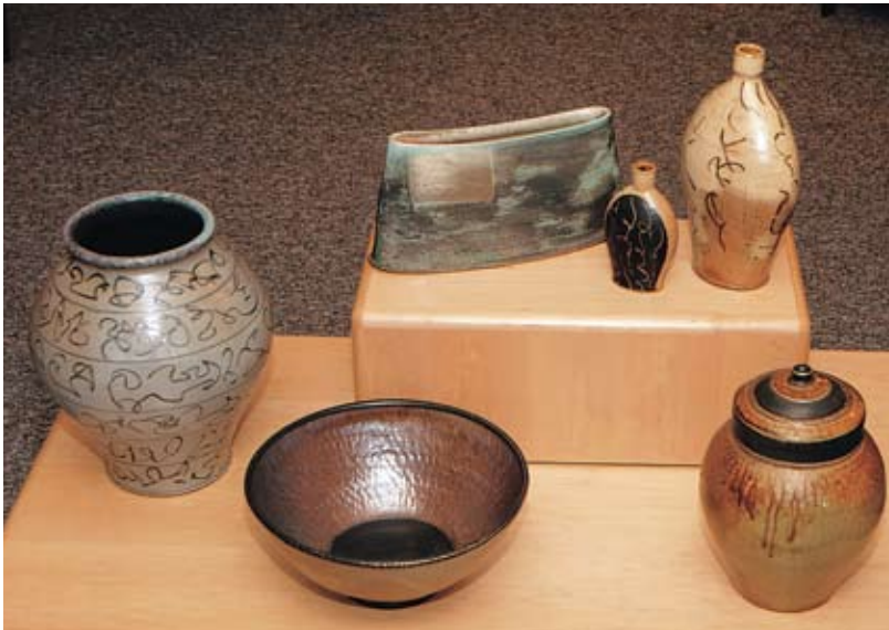
Earth and Fire, Herndon, Virginia, opened in 2001, and then in 2003 moved to a larger, more central location in Vienna, Virginia, www.earthandfiregallery.com .