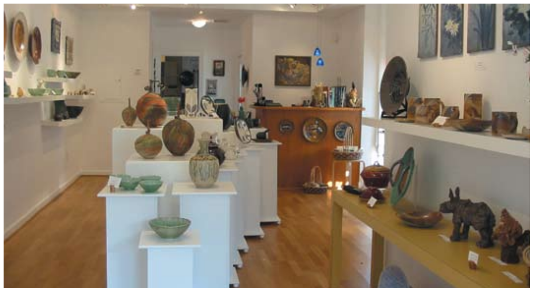
Top: Founded by potters, Ferrin Gallery opened its doors in Northampton, Massachusetts in 1979. From 1999–2002, they were an online-only gallery with plans to relocate in 2002. In 2004, the gallery moved to a larger space in Lenox, Massachusetts, www.ferringallery.com .