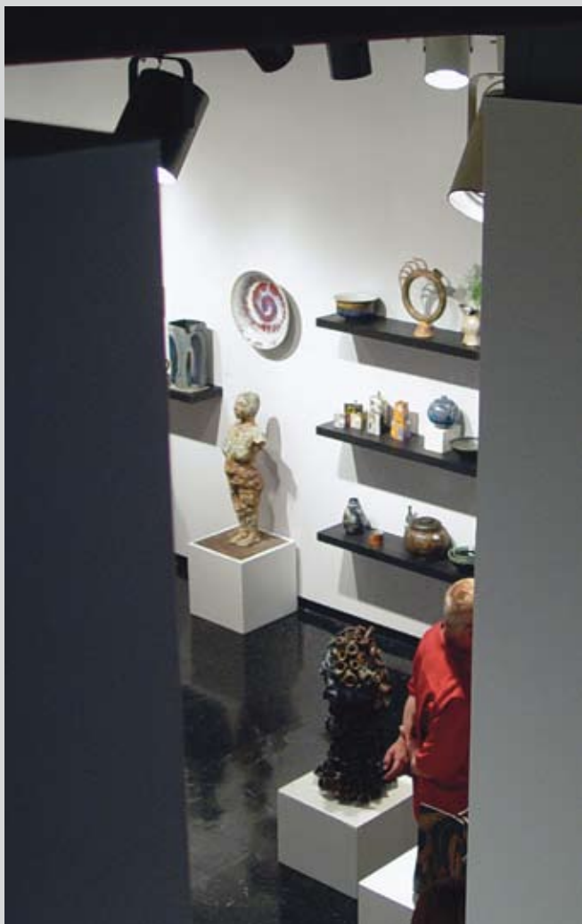
Before approaching a gallery, it is a good idea to visit as a consumer to see if it is the right fit for you and your work.

I asked representatives of two noteworthy galleries in Michigan what advice they would give aspiring artists when approaching galleries. They kindly offered the following.