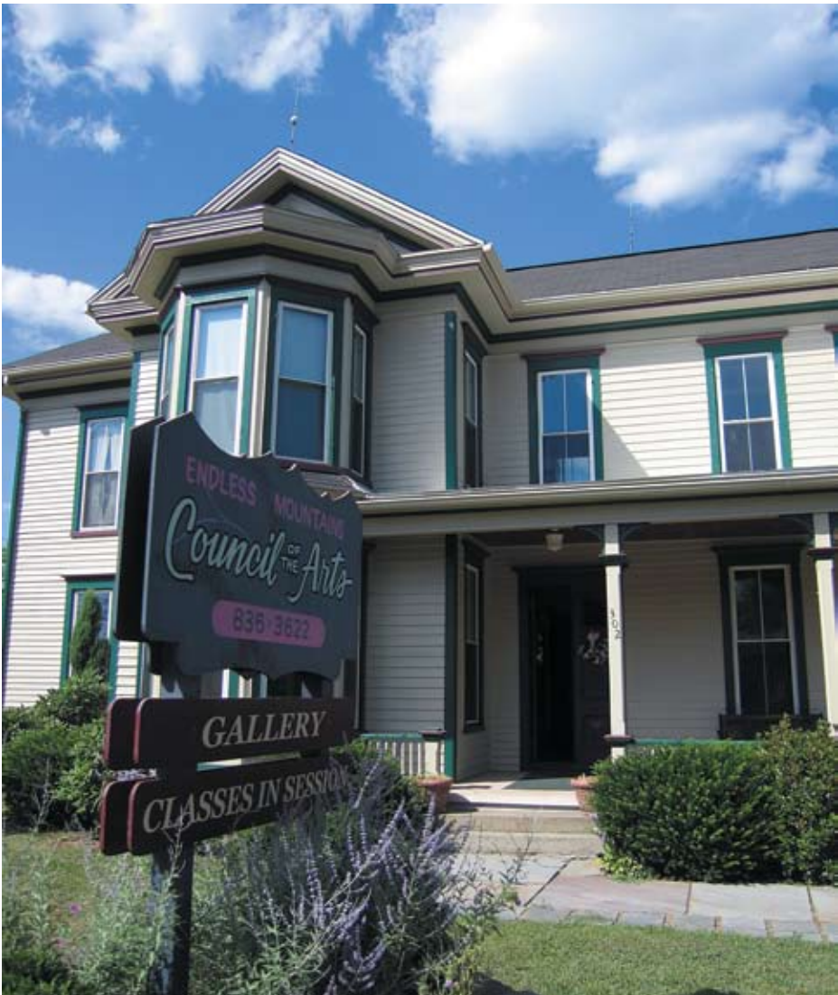
Though the Endless Mountains Council of the Arts (EMCA) in Tunkhannock, Pennsylvania, started in 1995, it wasn't until 1999 that the gallery was able to open, http://emca.emcs.net .