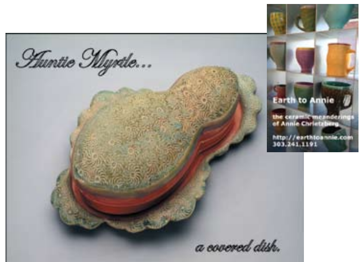
Above: When submitting a CD or DVD of images, an eye-catching postcard encourages the gallery owner to take a look. Above right: Your business card speaks volumes about you and your work.