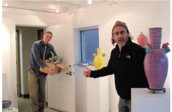
A surprise visit to a gallery with your work can be a major problem!

You can include a CD or DVD with digital images of your work, but to grab a gallery owner or director's attention and encourage them to actually stick the disk into their computer and open the files, include some high-quality printed images of your best pieces.