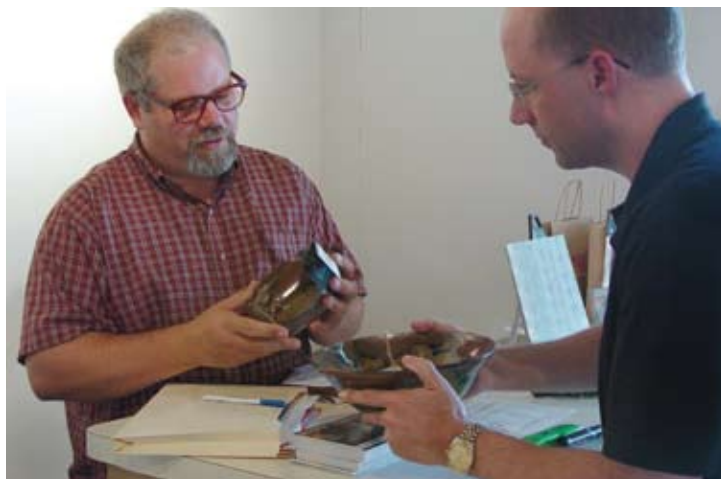
Whenever possible, I bring examples of my work to the gallery rather than slides or photographs.

Each gallery has studied their marketplace and has an understanding of why consumers come to them to purchase art. When a consumer visits that gallery, they expect to view artwork that meets a level of aesthetic beauty and artistic craftsmanship, and is within a certain price range.