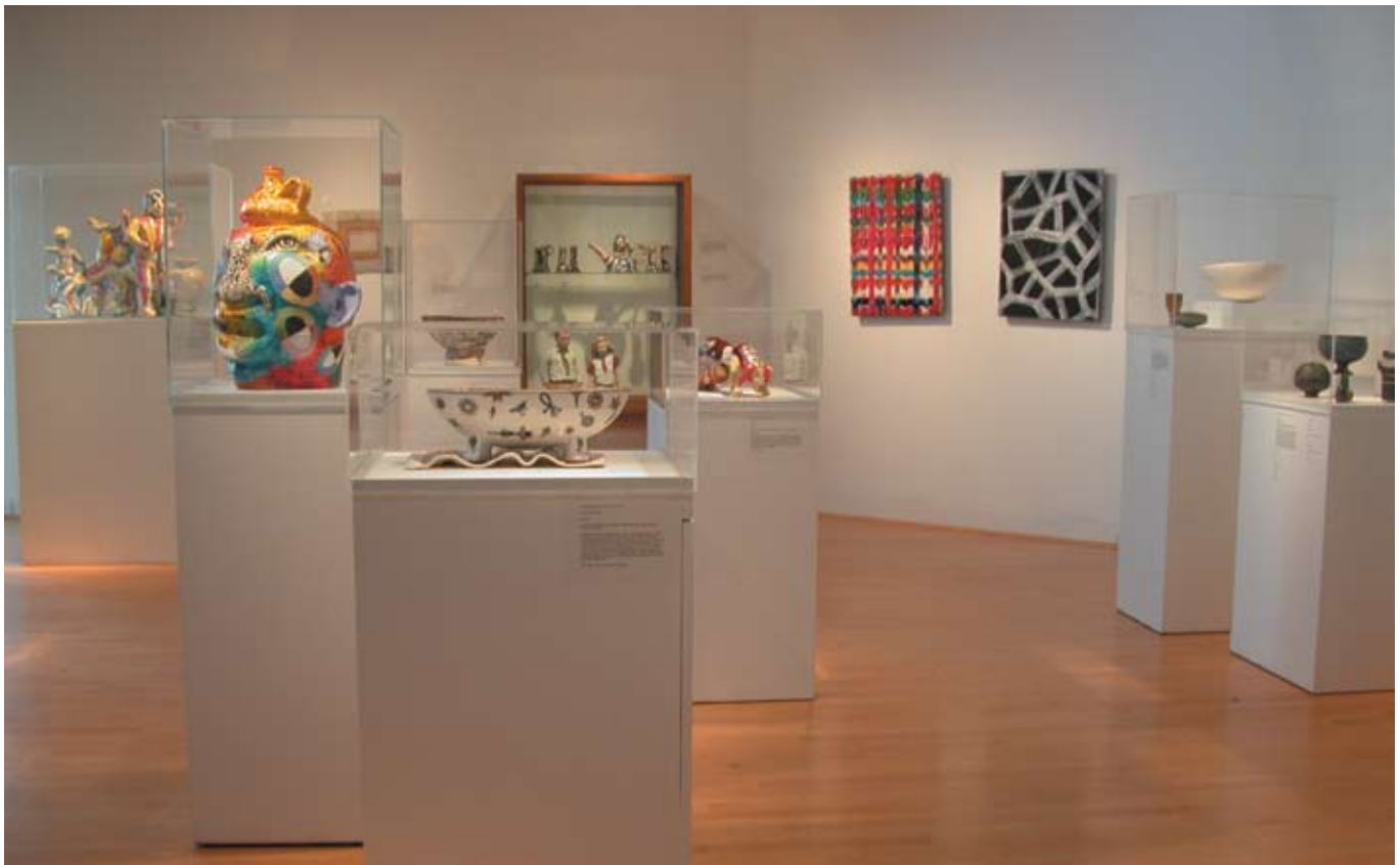
The Contemporary Crafts Museum & Gallery in Portland, Oregon, began its career as a ceramics studio in 1937.

The gallerists suggested different levels of artist involvement to make a show successful. Everyone wants a great image for mailings and a strong body of work for display.