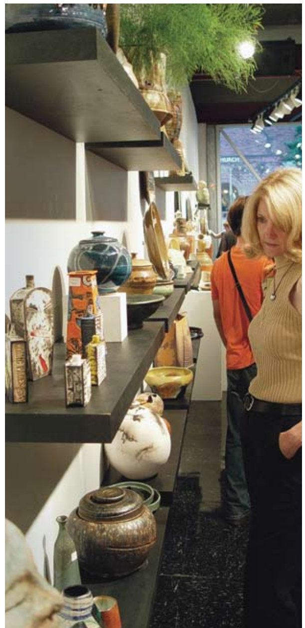
Attending local exhibitions is a great way to check out local galleries and fellow artists, but openings are not the time to approach a gallery about selling your work.